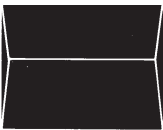
A-2, A-6, A-7, A-8, A-10